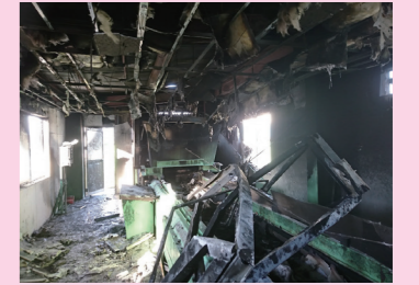
Reference: The Japan Containers and Packaging Recycling Association (JCPRA)