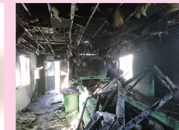
Reference: The Japan Containers and Packaging Recycling Association (JCPRA)